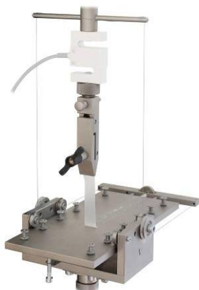
SP50 Peel test fixture

SPS470 can be used in combination with the following grips as upper grip: