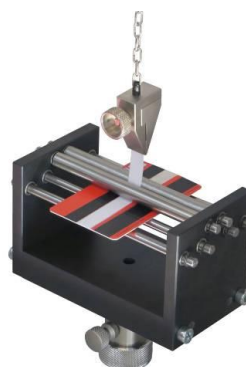
SP104 Peel test fixture